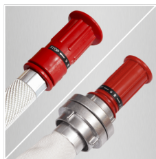
NOZZLE CONNECTION WITH HOSE