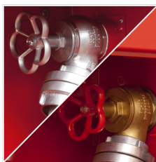
52 HYDRANT VALVE