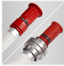
NOZZLE CONNECTION WITH HOSE