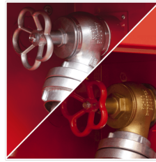
52 HYDRANT VALVE