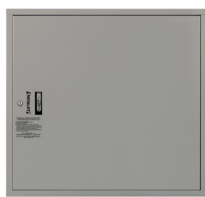
GALVANIZED STEEL SHEET

Lacquered with Facade type polyester facade paint. Solution resistant to atmospheric condition and UV radiation