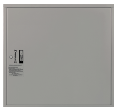
GALVANIZED STEEL SHEET

Lacquered with Facade type polyester facade paint. Solution resistant to atmospheric condition and UV radiation