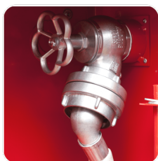
52 VALVE WITH SLANT REDUCTION

Hydrant can be connected to DN52 water supply due to 52 valve with slant reduction