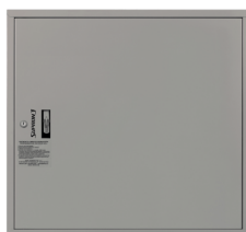
GALVANIZED STEEL SHEET

Hydrant can be connected to DN52 water supply due to 52 valve with slant reduction