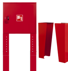
BASES / SUPPORTS