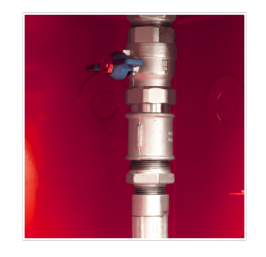
BALL VALVE 32 – OPTIONAL Possible to use 5/4" ball valve (32)

Hydrant can be connected to DN52 water supply due to 52 valve with slant reduction