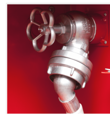
52 VALVE WITH SLANT REDUCTION

Hydrant can be connected to DN52 water supply due to 52 valve with slant reduction