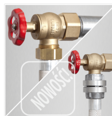
25 VALVE WITH ROTATING ADAPTER – OPTIONAL