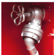
52 VALVE WITH SLANT REDUCTION

Hydrant can be connected to DN52 water supply due to 52 valve with slant reduction