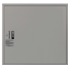
GALVANIZED STEEL SHEET

Lacquered with Facade type polyester facade paint. Solution resistant to atmospheric condition and UV radiation