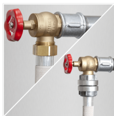
CONNECTION OF HOSE CONNECTING HYDRANT VALVE WITH WATER AXIS – STANDARD