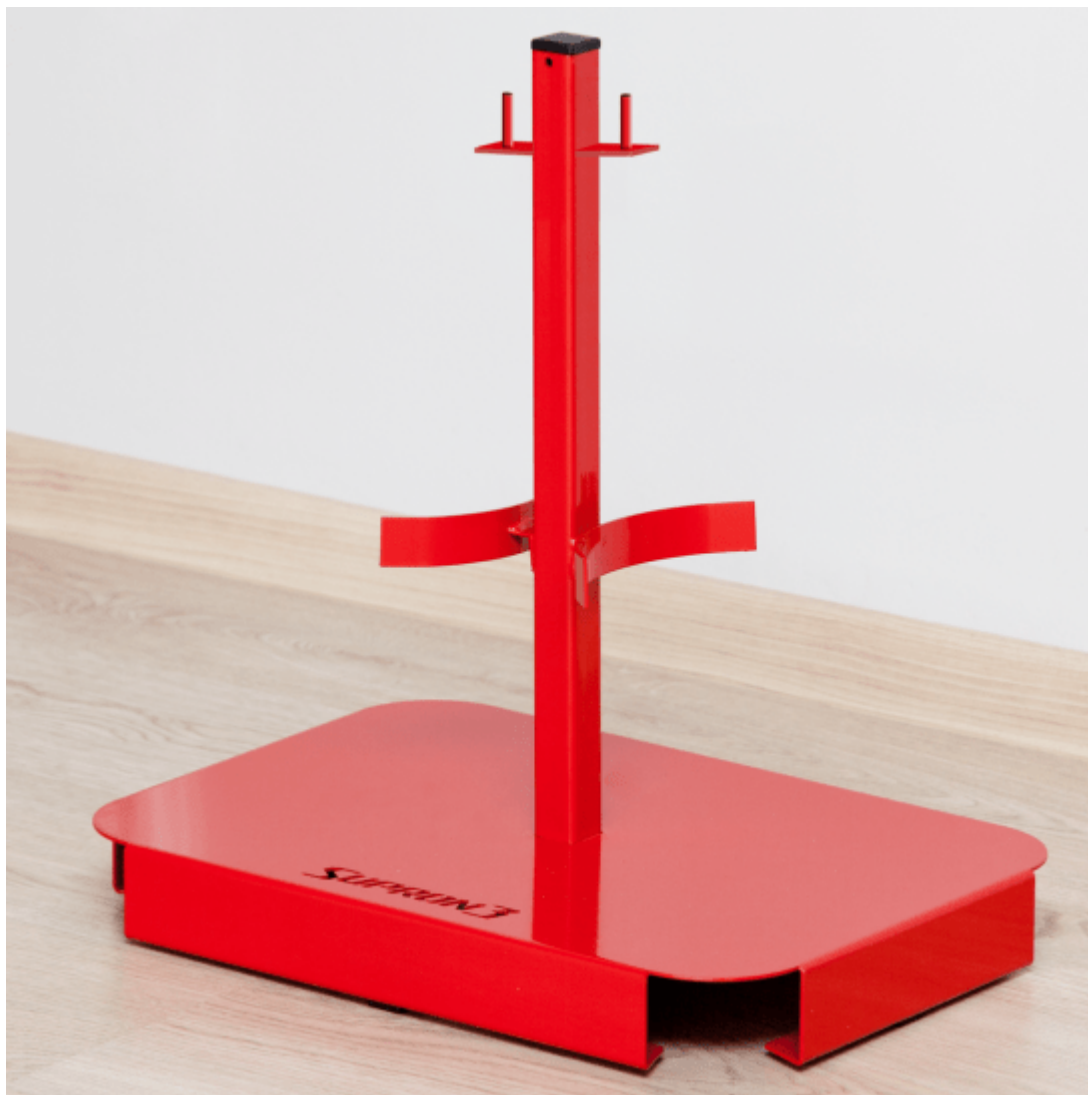
Stand for 2 fire extinguishers GS-5x (Code: S-SGG-ST-GSX2)