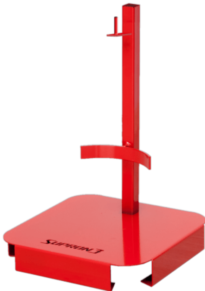
Stand for 1 fire extinguisher GS-5x (Code: S-SGG-ST-GS)