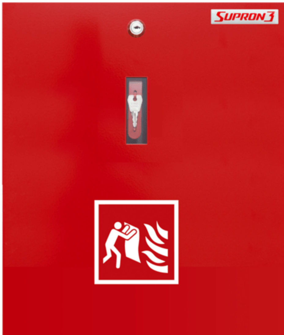
Cabinet for a fire blanket (Code: S-SO-KOC-400x340x50-P-3000)