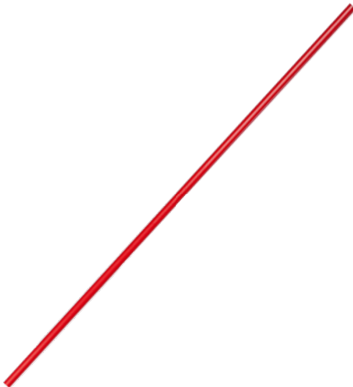
Mast for fire extinguisher stand (Code: S-SGG-ST-MASZT-RURA)