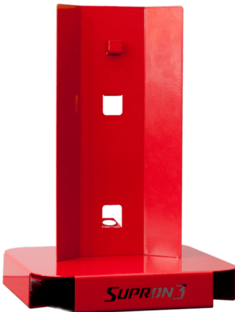
Stand for 1 fire extinguisher GP-4x to GP-6x (Code: S-SGG-ST-GP)