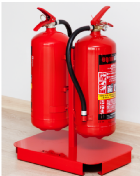
Stand for 2 fire extinguishers GP-4x to GP-12x (Code: S-SGG-ST-GPX2)