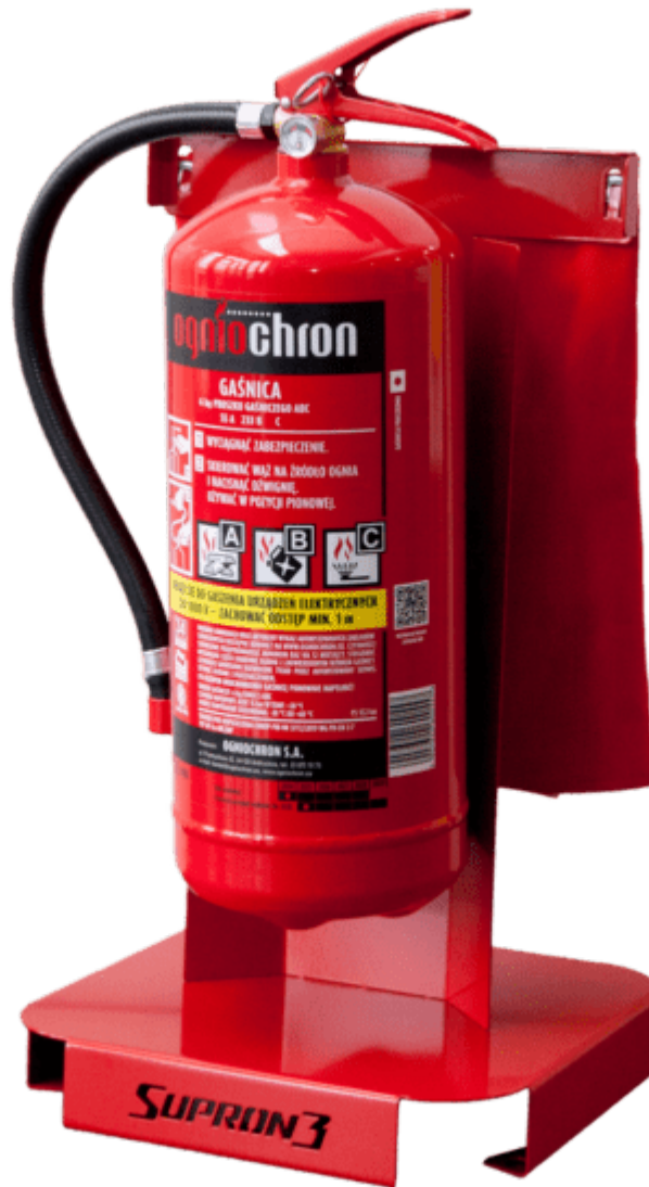
Stand for 1 fire extinguisher GP-4x to GP-6x and fire blanket 1,2×1,8m (Code: S-SGG-ST-GP-UCHWYT-KOC)