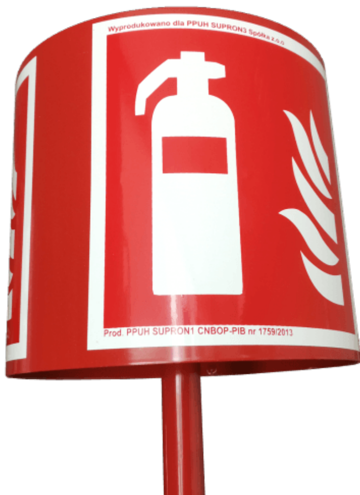
"Cylinder" mast head (Code: S-SGG-ST-MASZT-GŁW)