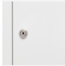
PATENT LOCK - WITHOUT A KEY

Large quantity of cabinets can be opened with one key. The key for emergency opening is located behind the safety glass.