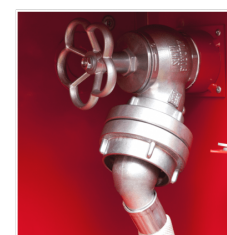
52 VALVE WITH SLANT REDUCTION

Hydrant can be connected to DN52 water supply due to 52 valve with slant reduction