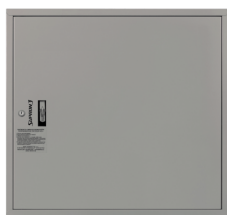
GALVANIZED STEEL SHEET

Lacquered with Facade type polyester facade paint. Solution resistant to atmospheric condition and UV radiation